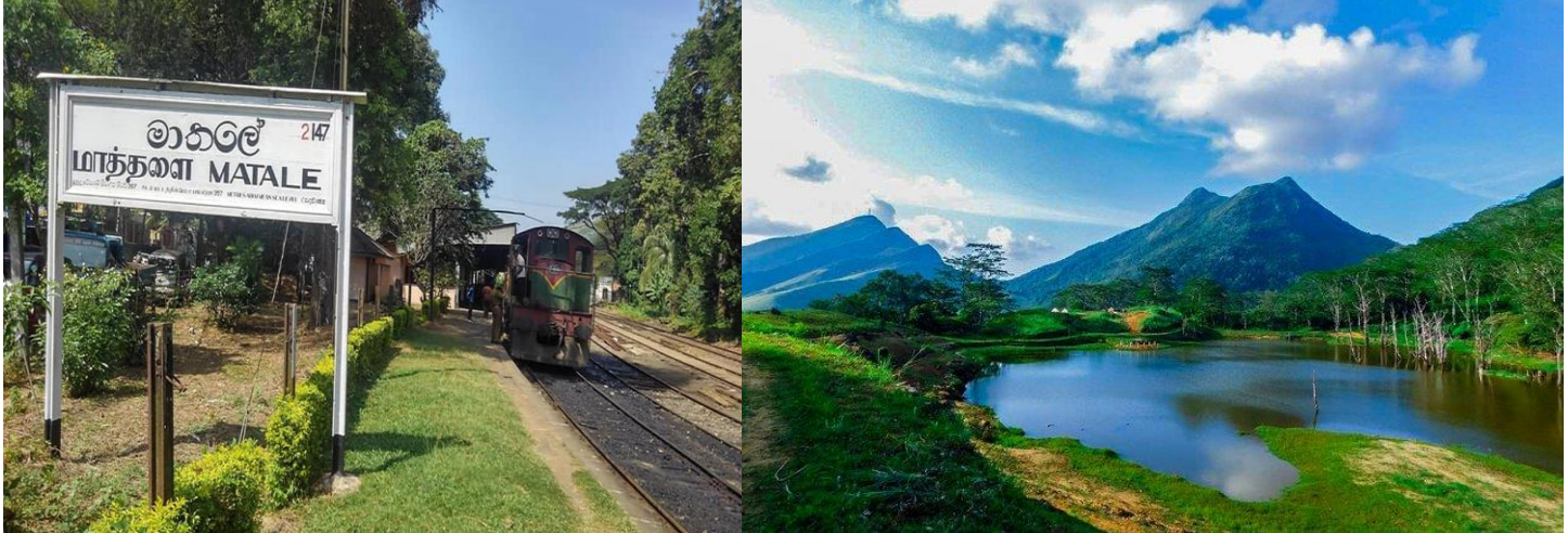
Proceed to KANDY via the famous spice gardens of Matale for which Sri Lanka is famous for. Aromatize your senses and learn how spices are grown and processed. Witness a Cookery demonstration. Check in at the hotel. Overnight stay at Earl's Regency or Topaz Hotel.