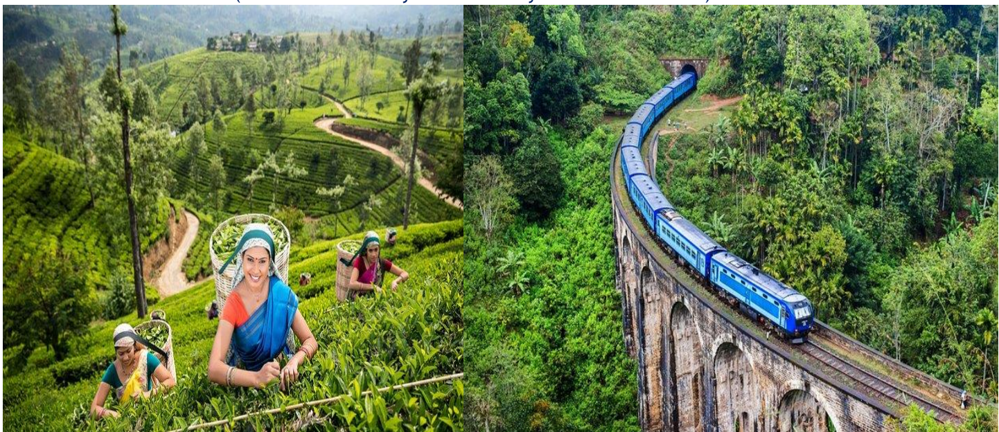
DAY 05: NUWARA ELIYA (Distance from Kandy to Nuwara Eliya 2H27MIN = 76.1KM)

Head to NUWARA ELIYA , en-route visit a tea plantation and factory, where the best tea in the world is produced. Here you could observe all about the process of manufacturing tea. You can also see how tea is graded. Taste a cup of pure Ceylon tea in the factory.