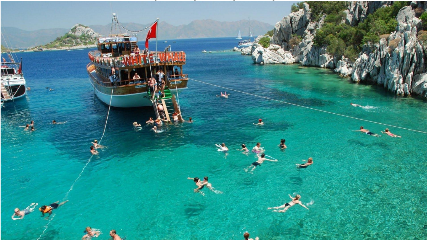
Summer: Problems get lighter. Living gets easier

Package is quoted Per Person, in USD and includes: