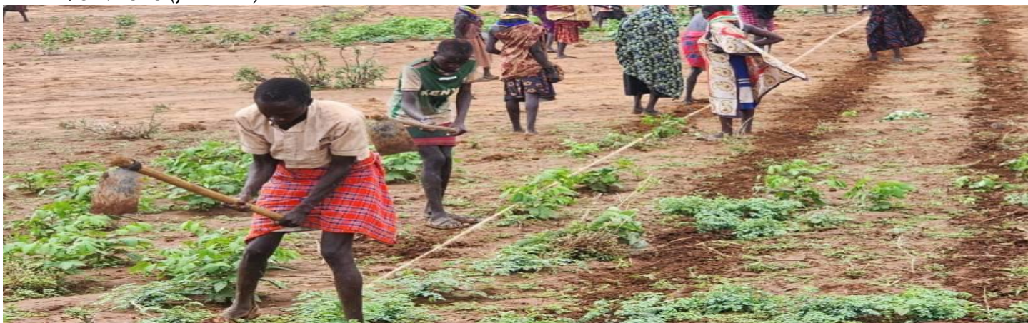
The Special Five