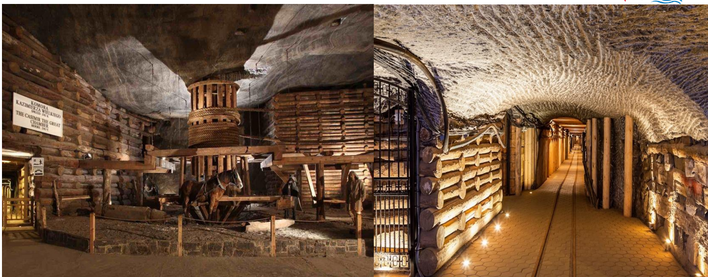
After the visit to Wieliczka Salt Mine, transfer to Zakopane. Overnight in Zakopane.